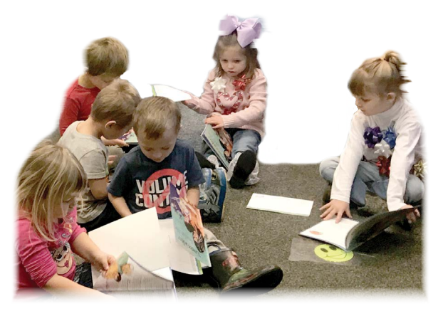
Children enrolled in the Head Start program received their first books from the newly established Ferst Readers program in Brantley County just before Christmas, thanks in part to a donation from OREMC.

Giving back to the community is also one of the seven cooperative principles, and OREMC is able to make a donation such as this by using unclaimed